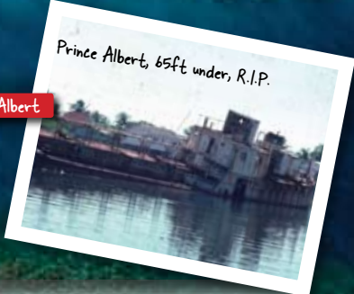
Prince Albert, 65ft under, R.I.P.