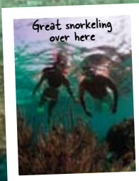
Great snorkeling over here