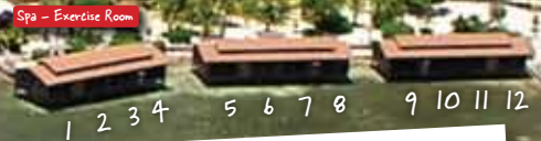
Spa - Exercise Room