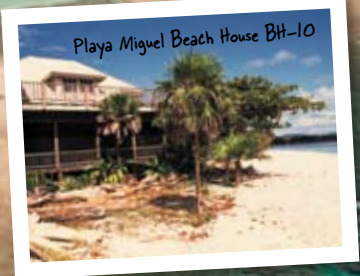
Playa Miguel Beach House BH-10